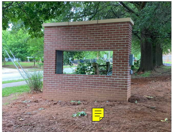
Monument sign cast stone has been installed. Currently ready to install LED Message Boards