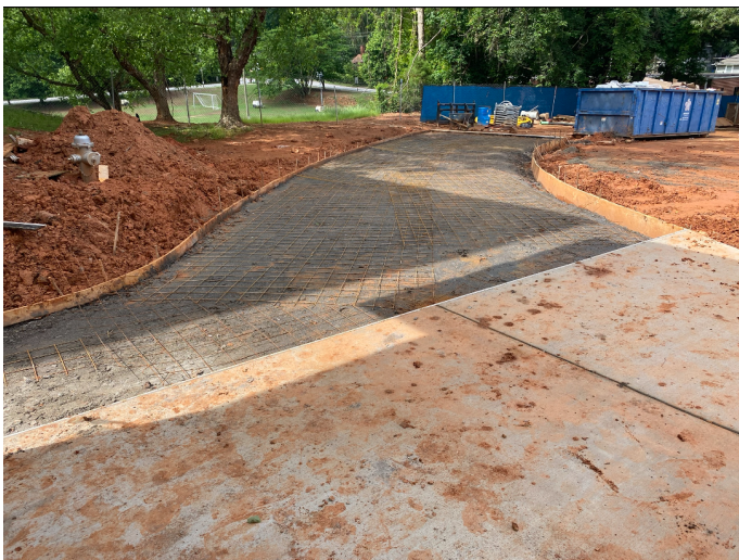
Complete sidewalk pour back this week on Saturday - 05/11/24